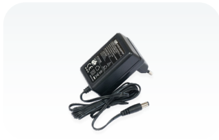
24 V 0.8 A power adapter