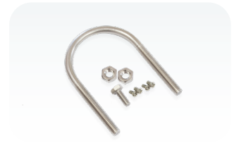
K-70 fastening set