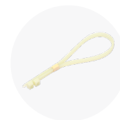
2x plastic straps