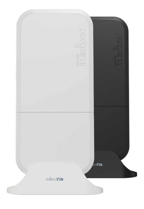
Available in two colors

With the new revision, we have significantly improved the thermal properties of the enclosure – you don't have to worry about any overheating!