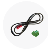
Battery DC wire with T2 Tab terminal (also fits T1)