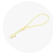
Plastic zip tie