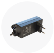
24 V 1.5 A Power adapter