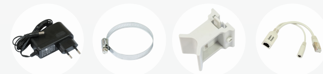
24V 0.38A Adapter