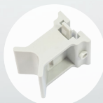
Pole mounting bracket