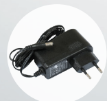
24V 0.38A Adapter