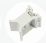
Pole mounting bracket