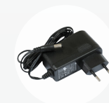
24V 0.38A Adapter